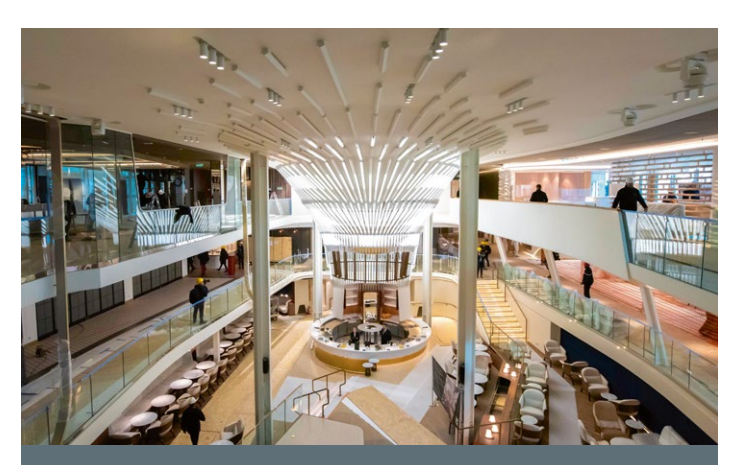
The Grand Plaza is the centrepiece of Celebrity Cruises' newest ship, Celebrity Apex. The chandelier is made up from over one kilometre of LED lighting strips.

Almaco's hand sanifisers blend in seamlessly to the cruise experience, allowing safety practices to be maintained onboard and help safeguard the well-being of passengers and crew.