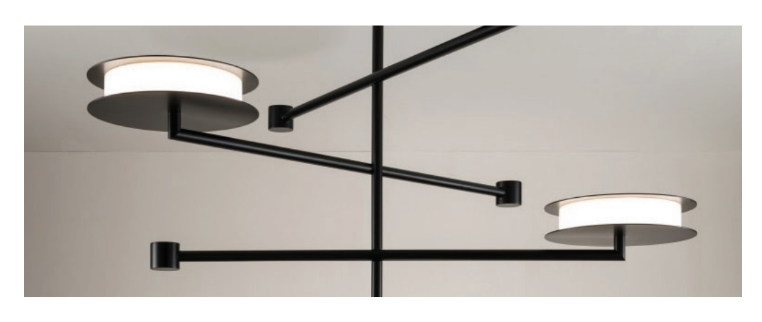
EMPORIUM 131 -133 >