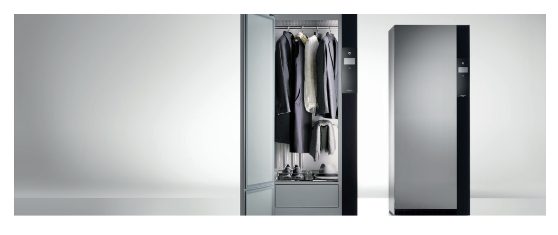
GUESTROOMS 126 >