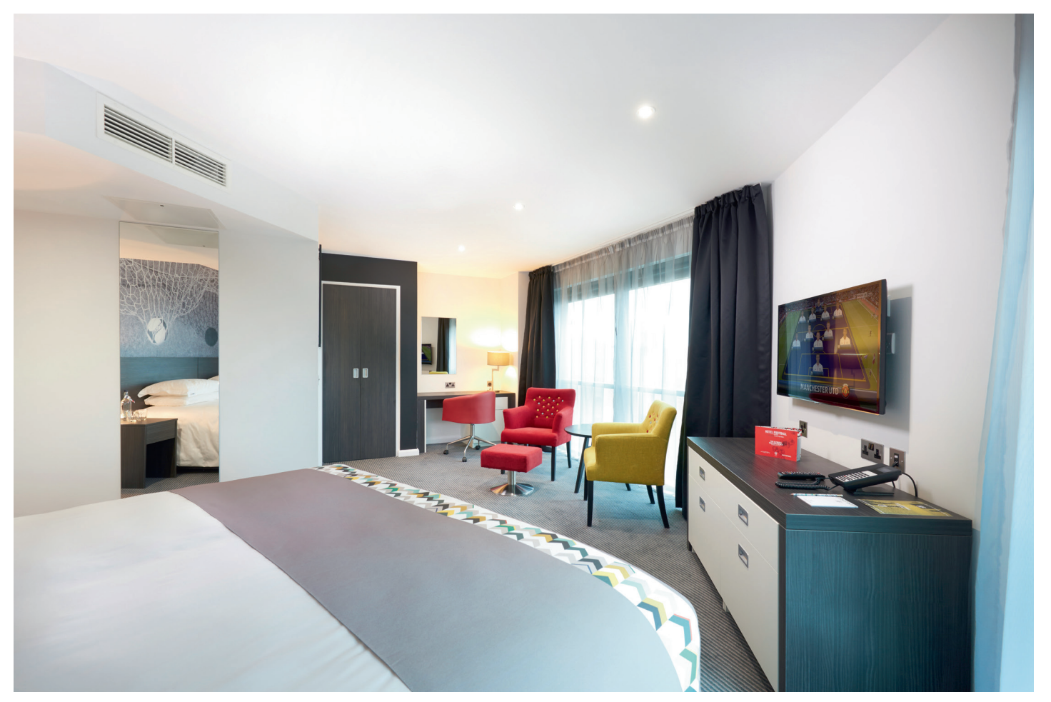
Above: Guestrooms feature king-size Hypnos beds, 'Swing' brushed nickel table lamps by Chelsom and 40-inch Samsung TVs. UHS Group also worked closely with the design team to provide furniture – some of which is custom-made – throughout the hotel

Old Trafford hotel, but clearly the ambition, and the potential, is there for a global roll-out.